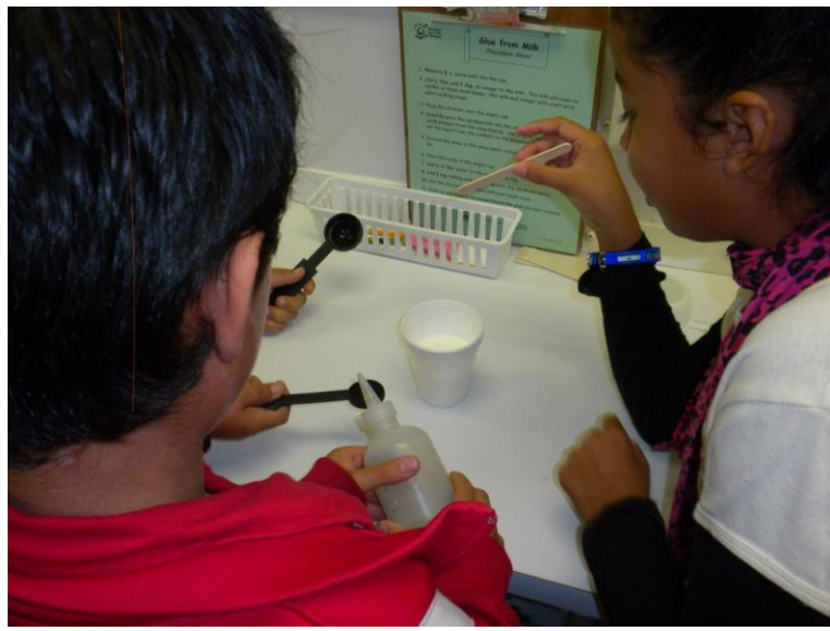
Young chemists in action.

Retired science teachers skilled in making science "come alive" promote the importance of agriculture in our daily lives, and conduct experiments featured on the lab's kid-sized workbenches. Younger students heard a story about cows, talked about dairy foods, made butter from heavy cream ("shaka, shaka, shaka" for an arm-exhausting 10 minutes), and then taste tested their experiment on graham crackers.