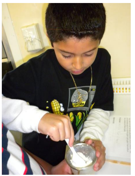
Student separates curds from whey.