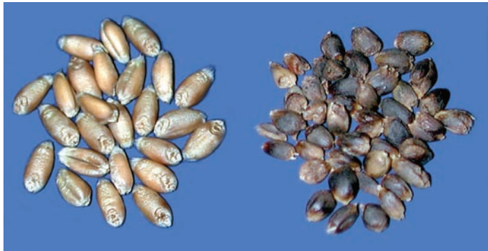
Healthy wheat (left) and wheat infected by the wheat seed gall nematode.